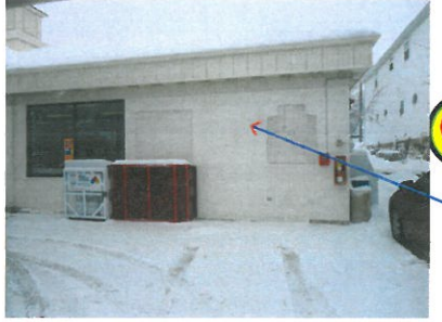
3. (1) COUSINS LOGO - 8 SQ. FT. TOTAL TO REPLACE TWO SIGNS PREVIOUSLY REMOVED WHICH WERE 35 SQ. FT. TOTAL