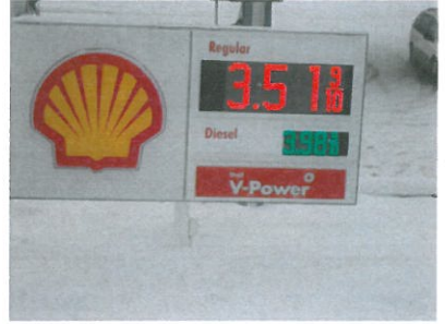
2. (2) MONUMENT SIGNS - 64 SQ. FT. TOTAL SIGN FACE W/ 8 SQ. FT. ACTUAL EACH FACE = 16 SQ. FT. TOTAL SIGNAGE