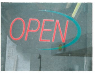
4. (1) "OPEN" SIGN - 3 SQ. FT.