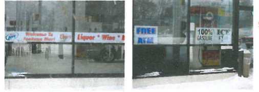
5. MISCELLANEOUS SEASONAL SIGNAGE APPROXIMATELY - 10 SQ. FT.