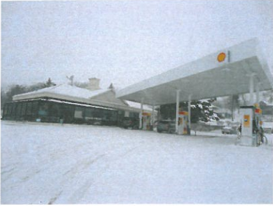
1. (2) SHELL LOGOS - 6 SQ. FT. TOTAL